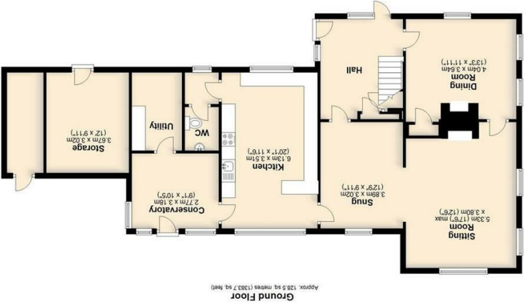
Ground Floor Approx. 126.5 sq. metres (1362.7 sq. feet)

Total area: approx. 221.7 sq. metres (2366.3 sq. feet)