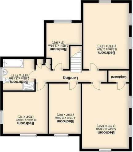
First Floor Approx. 95.2 sq. metres (1022.7 sq. feet)

10 Market Hill Diss Norfolk IP22 4WJ 01379 641341 prop@twgaze.co.uk